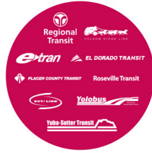
One Card to Ride Them All