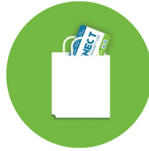
More Ways to Pay