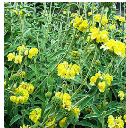
Phlomis fruticosa Jerusalem Sage