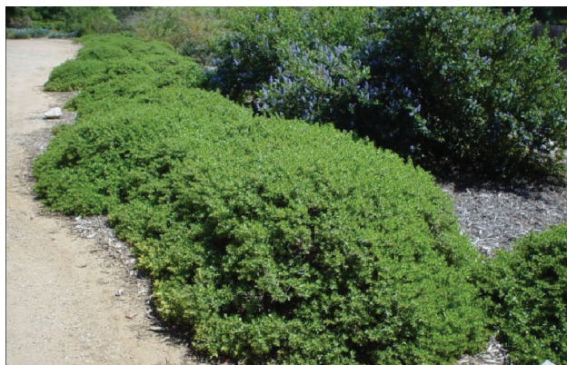
Baccharis pilularis 'Twin Peaks #2' Twin Peaks #2 Ground Cover Baccharis