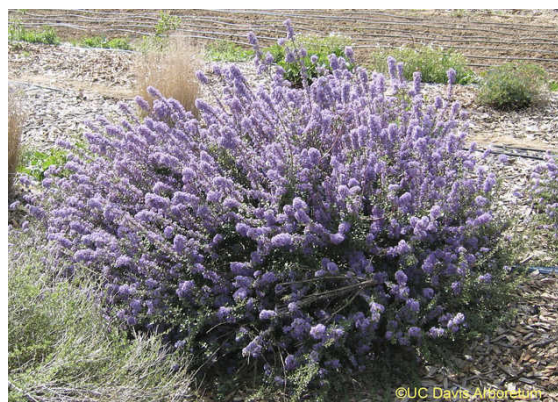
Ceanothus maritimus 'Valley Violet' Violet maritime ceanothus