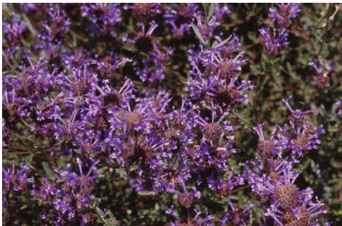
Salvia clevelandii 'Winnifred Gilman' Winifred Gilman Blue Sage