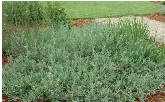
Salvia 'Bee's Bliss' Bee's Bliss Creeping Sage