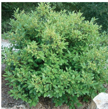
Rhamnus californica 'Eve Case' Eve Case Compact Coffeeberry