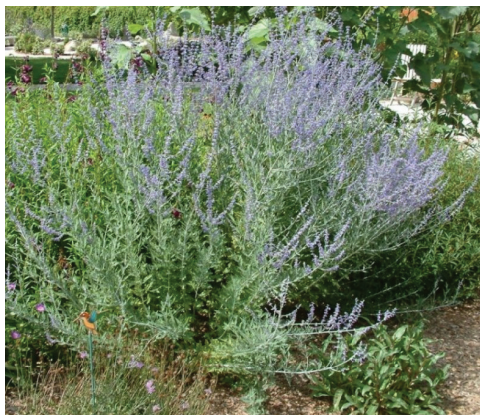
Perovskia x atriplicifolia 'Lacey Blue' Lacey Blue Russian Sage