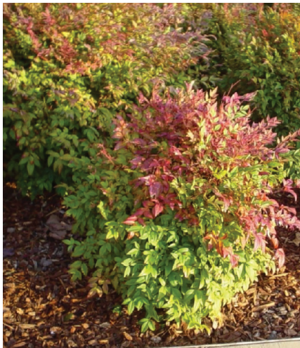
Nandina domestica 'Harbour Dwarf' Heavenly Bamboo Harbour Dwarf