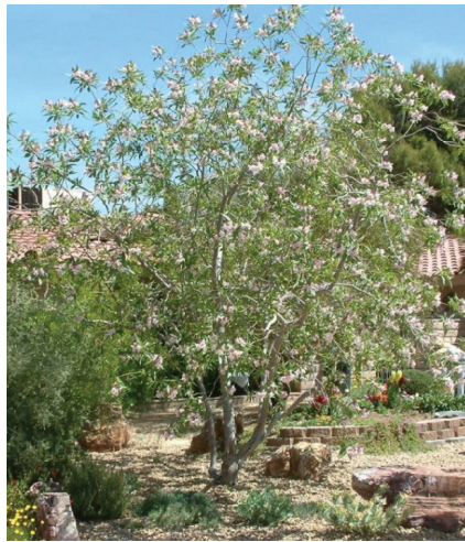
Chitalpa X tashkentensis 'Pink Dawn' Chitalpa Pink Dawn